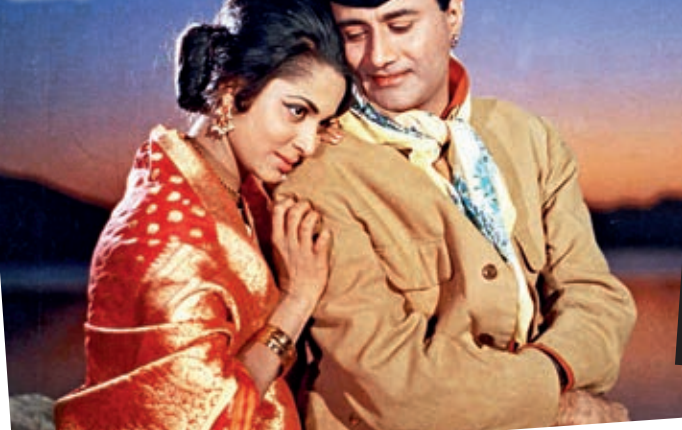
A still from Guide (1965)

Meri kismat achhi thi aur Dev ne soch liya tha ki Guide mein Rosie ka role main hi karungi. That made me very happy and confident. I told him, 'Ismein aap jo marzi scene cut karo, magar mera koi bhi dance cut nahi hoga.' It was the only film where