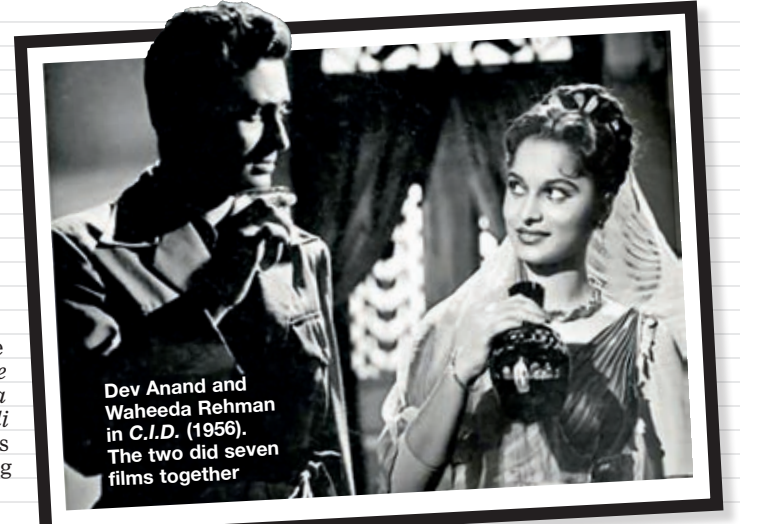
Dev Anand and Waheeda Rehman in C.I.D. (1956). The two did seven films together