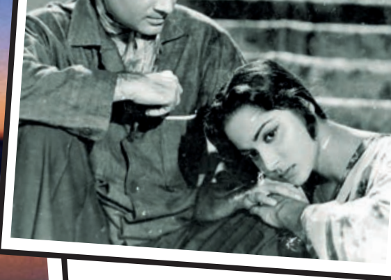
A still from the 1962 film Baat Ek Raat Ki

'Tum mera dil dukha rahi ho' (Dev said), and I replied, ' I'm sorry. Tell them kuch bhi kar ke aaye. Unke bagair main nahi aa sakti.