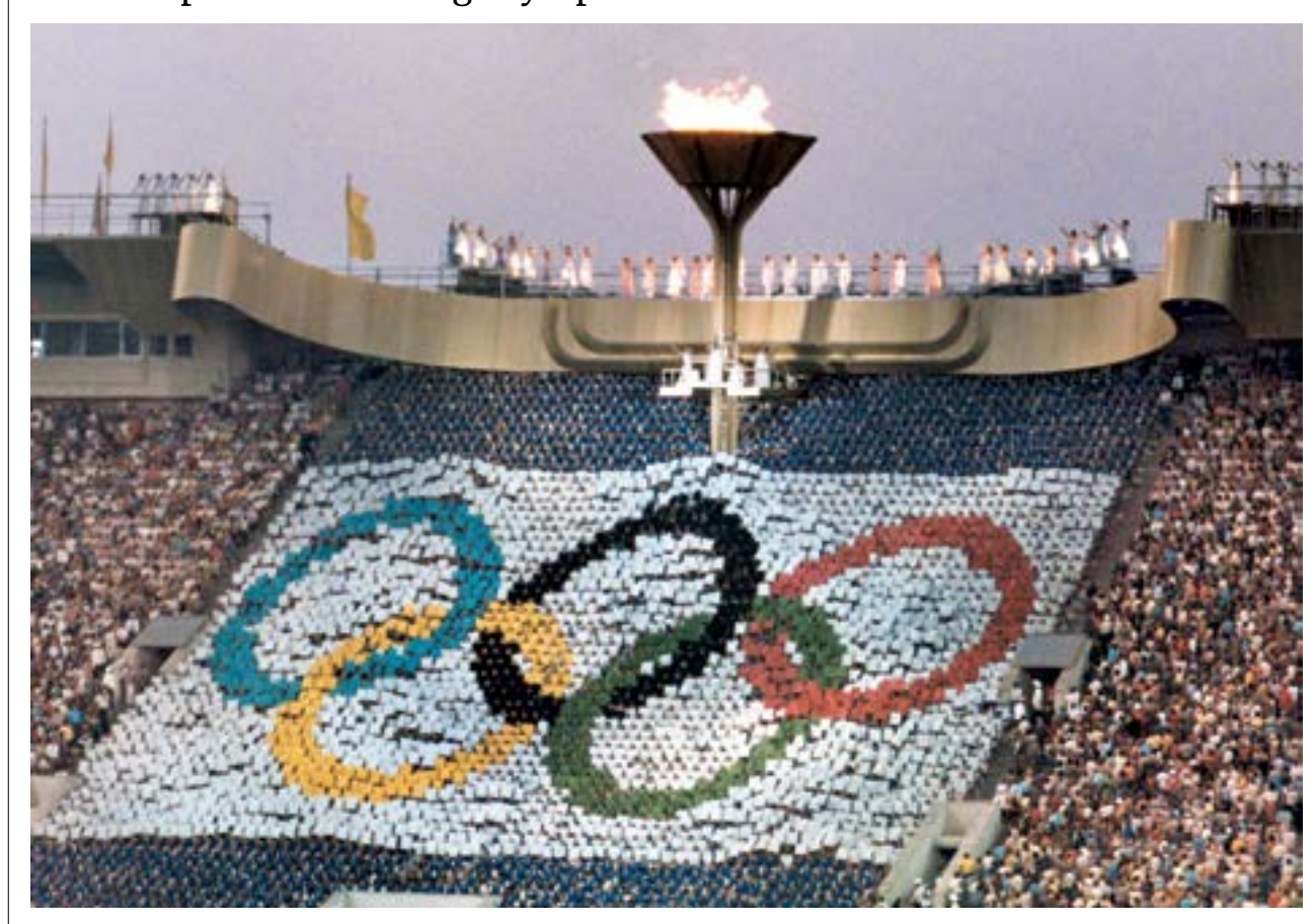
A frame from the 1980 Olympics at Moscow in the film, O Sport — ty, mir! by Yuri Ozerov

This weekend, a unique event brings to the city the spirit of the Olympics in the form of rare archival film screenings, photography exhibitions and workshops in a week-long Olympic festival