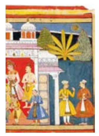
A partial illustration of Rama and his brothers.

TIME 11 am to 10 pm LOG ON TO mow@csmvs.in (to register for the session)