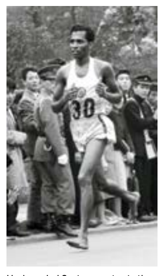
Harbans Lal Suri competes in the marathon at the 1964 Olympics in Tokyo

FROM October 2 to 7; 10 am onwards Al Little Theatre; Godrej Dance Theatre; Open Air Plaza; NCPA, Nariman Point. TO @filmheritagefoundation on Instagram