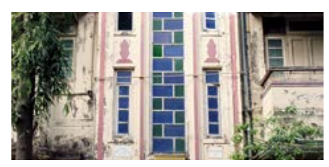
Prahlad Bhavan, the Art Deco residence of Prahlad Dalmia built in 1949